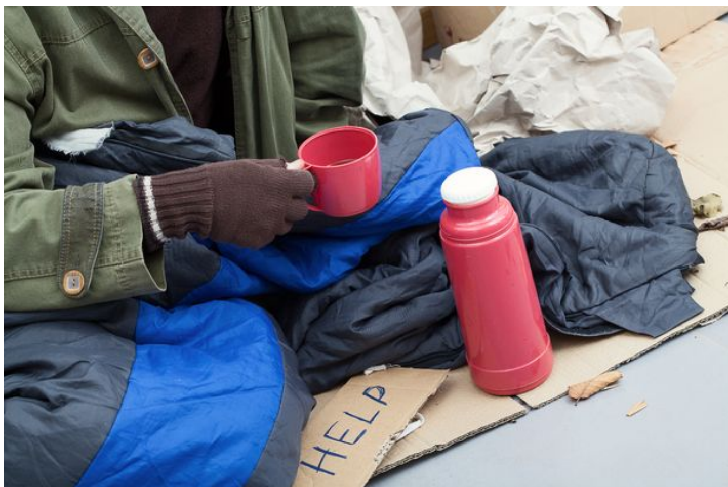
Beggar warming himself by a hot tea

"The roles of our partners are critical and we recognise all their work in providing accommodation, supporting residents and sustaining tenancies; it is with our partners that we have managed to achieve the success we have.